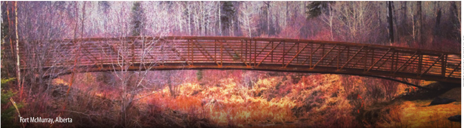
Fort McMurray, Alberta