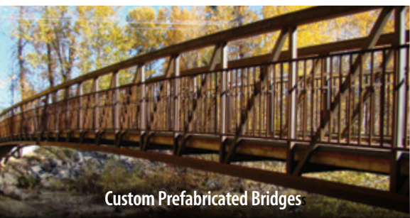
Custom Prefabricated Bridges