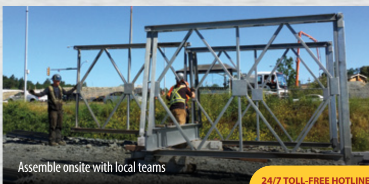
Assemble onsite with local teams