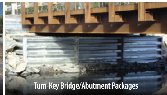
Turn-Key Bridge/Abutment Packages