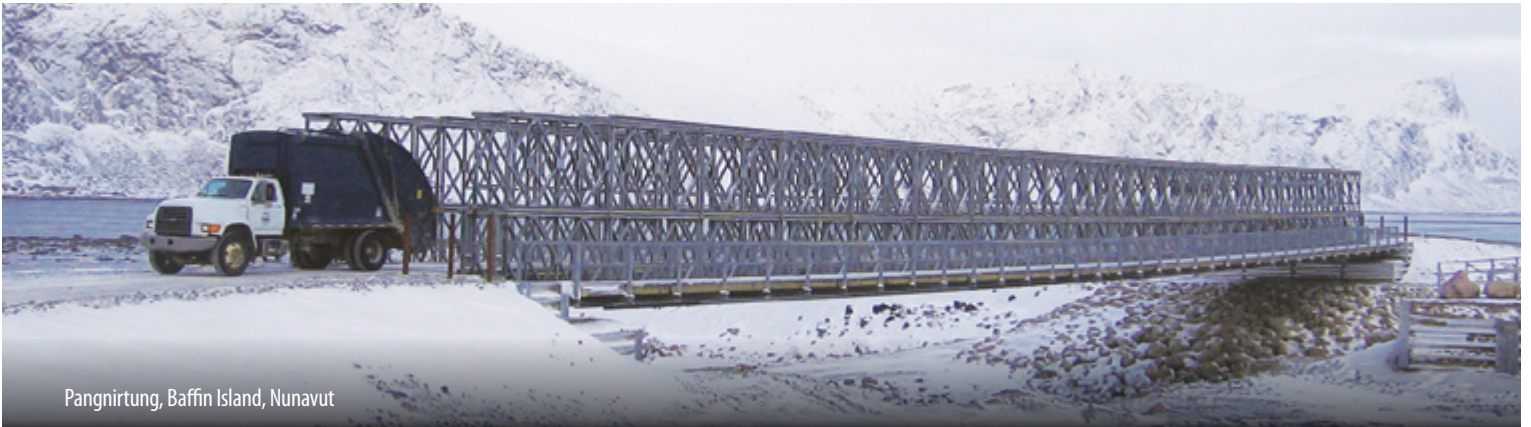
Pangnirtung, Baffin Island, Nunavut