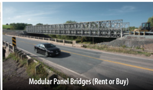
Modular Panel Bridges (Rent or Buy)