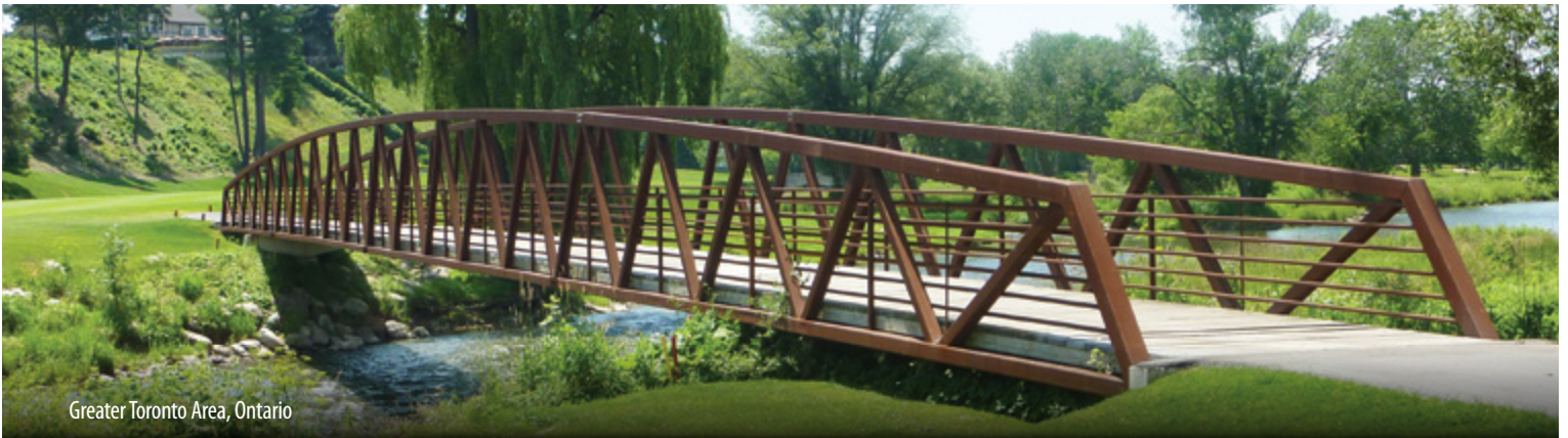
Greater Toronto Area, Ontario

Our products contain recycled content and are 100% recyclable.