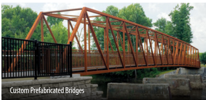
Custom Prefabricated Bridges