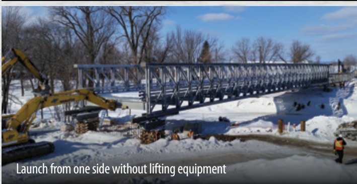
Launch from one side without lifting equipment