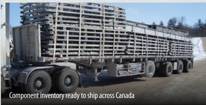
Component inventory ready to ship across Canada

As Canada's go-to emergency bridging specialist, Algonquin Bridge is ready to respond with available inventories of Algonquin Modular Panel Bridge Systems, in-house engineering and reliable field service.