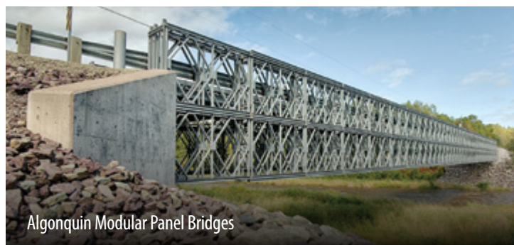
Algonquin Modular Panel Bridges