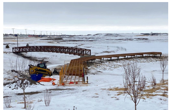
Pedestrian Bridge design integrates with boardwalk