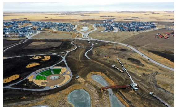
Pedestrian Bridge installed near Core Park's amphitheatre