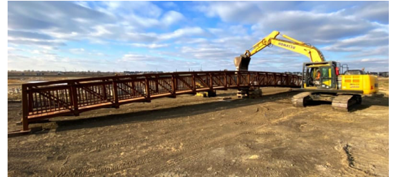
Pedestrian Bridge delivered in two sections and assembled on-site

121 Gerald Parkway Thorndale, ON N0M 2P0 1-226-213-4707 algonquinbridge.com