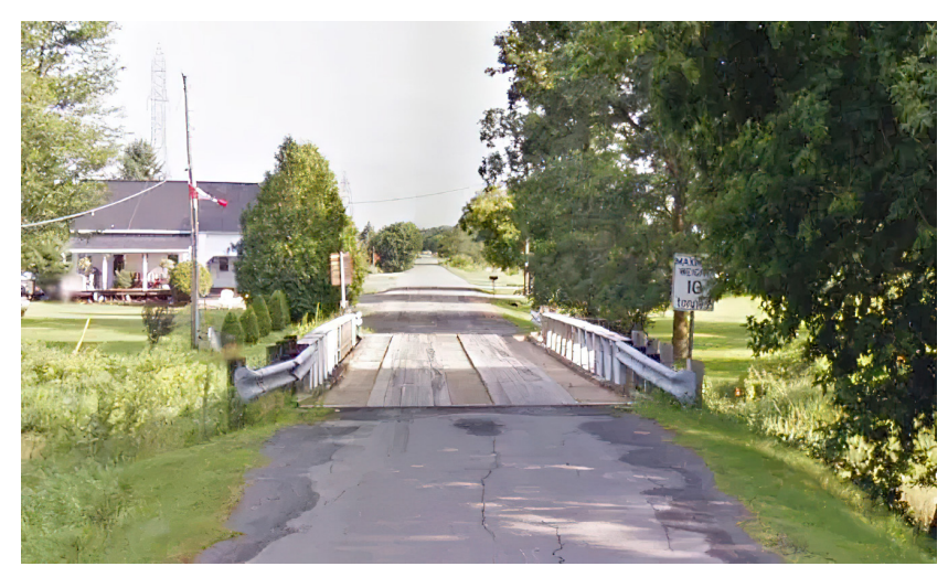
The original bridge was ordered closed due to "failing in key areas"

The old Taylor Road Bridge in Brinston, Ontario, had been closed for some time and the Municipality of South Dundas wanted it replaced as soon as possible. Suffice to say, this project was an excellent example of efficiency in meeting a quick project timeline.