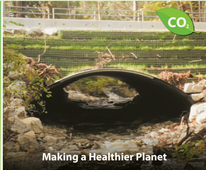
Making a Healthier Planet

Sustainability is integral to our business. Plus, it's the right thing to do.