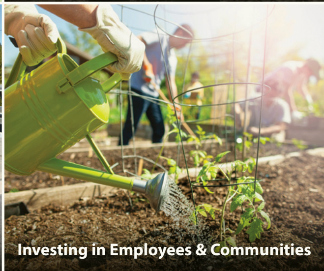
Investing in Employees & Communities